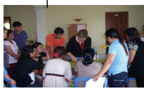
Quilters making a difference

If any of you in the Sacramento area would be