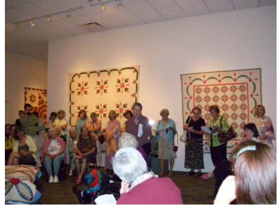
Who are modern dedicated quilters?

Here are some of the results that might interest our members.