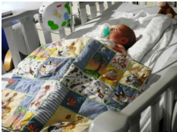
The gift of a quilt to a seriously ill newborn comforts the entire family.

Please visit www.quiltsforkids.org for more info.