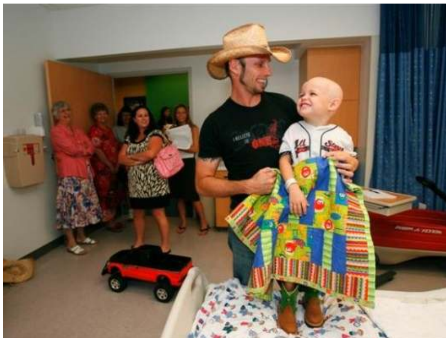
Generating smiles, one quilt at a time.

Map to New Fairfield meeting location is on the NCQC website