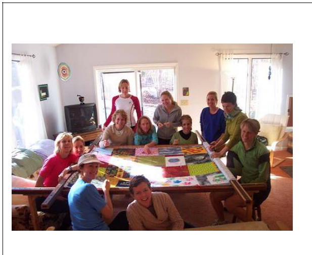
What unites us is even more than we imagined

But people love to meet other people with whom they share ideas and interests and talk face to face. When we do, we find out that what unites us is even more than we imagined.