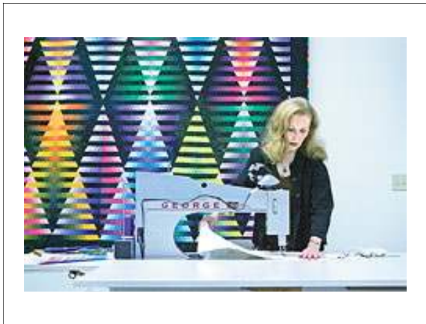
New ways to reach out to customers, techniques, and friendship groups.

The October 19, 2011, NCQC quarterly meeting will be a panel of talented quilters who have conquered their fears of change and new ways to communicate in our world of today.