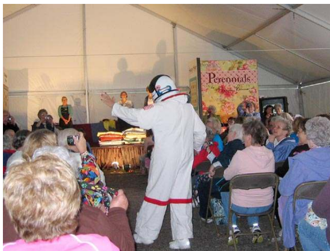
Elanor Burns Paducah Tent Show 2011

The 21st century is here to stay and the quilting opportunities that are open to all of us are bigger and better than ever.