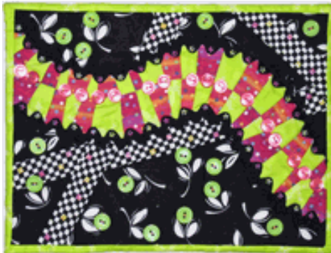
Raising awareness and funding research through Art