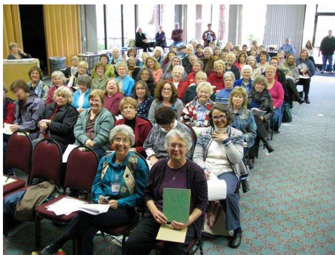
Meet the Teachers meetings are now in April & July for 2012. Hope to see you there.

Teaching like quilting is an art in itself