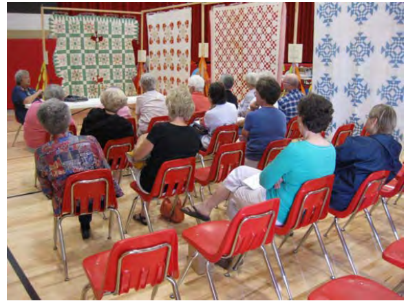
Some good ideas for meetings

Are you looking for guild meeting ideas that involve the members?