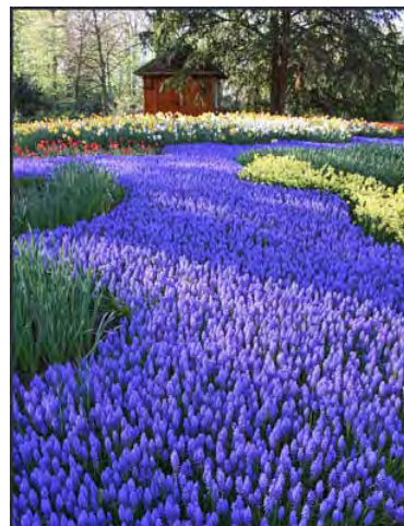
Spring: Priceless Fun. Low-Cost Guild Meetings

This month the topic will be successful low-cost guild programs and we hope to provide you some good ideas for your guilds.